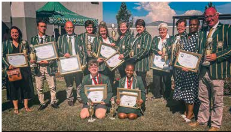
Ben Viljoen staff shines bright during the District Excellence Award Ceremony!

Hoërskool Ben Viljoen also takes second place in the district with 78% of our matriculants from 2023 gaining Bachelor's degree admission.